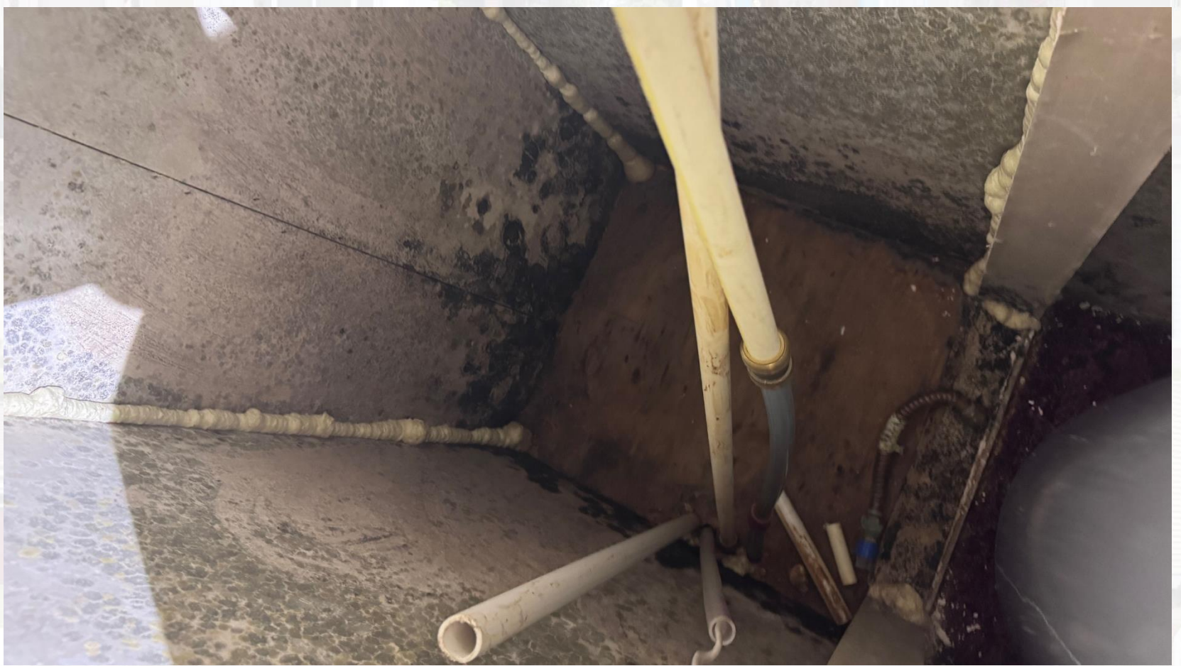
Mold and moisture example